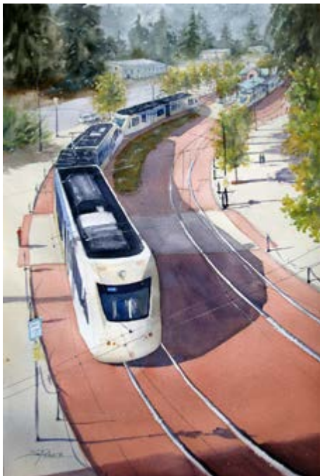
Eastbound Train by Sandra Pearce