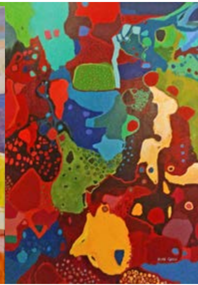
The Conflict (Rebeck O) by Plata Garza