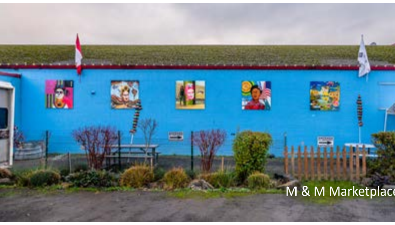
M & M Marketplace