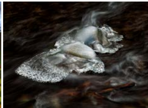
Wahkeena