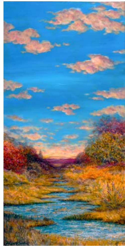
FALL in love with Hillsboro