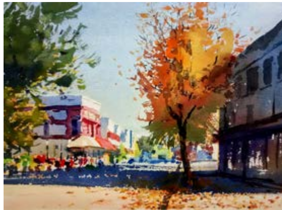
On Main Street in Downtown Hillsboro by Yong Hong Zhong