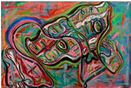
Chasing Lights by Donovan Sinclair

The Walters Gallery showcases a diverse selection of artwork by both established and emerging local artists. First Tuesday gallery receptions happen every month. Note: Gallery hours and First Tuesday events are subject to change. Visit Hillsboro-Oregon.gov/CulturalArts for updates.