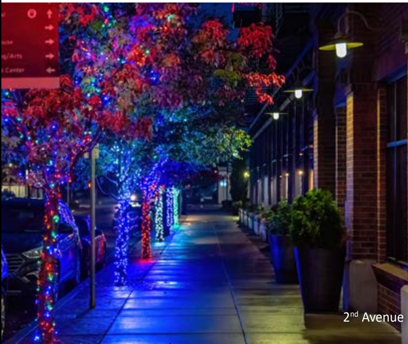
2 nd Avenue