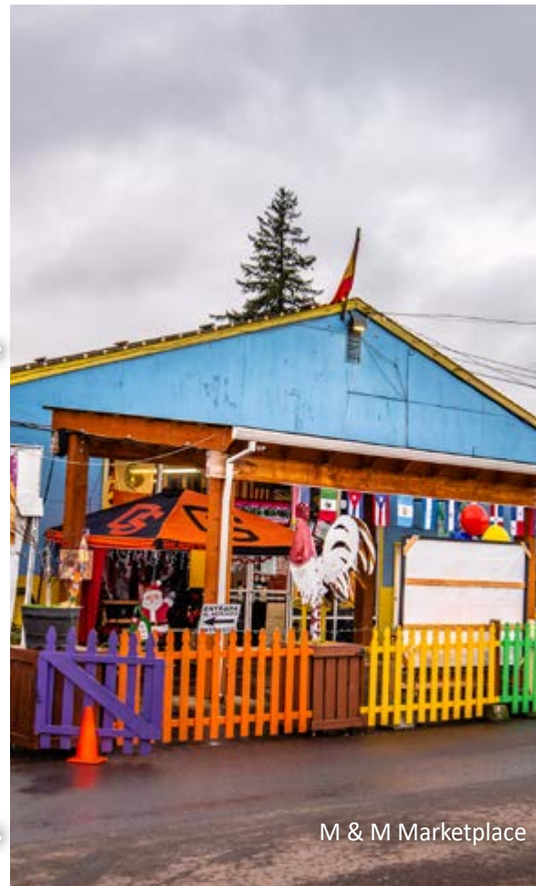
M & M Marketplace