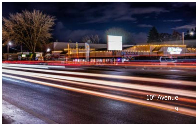
10 th Avenue