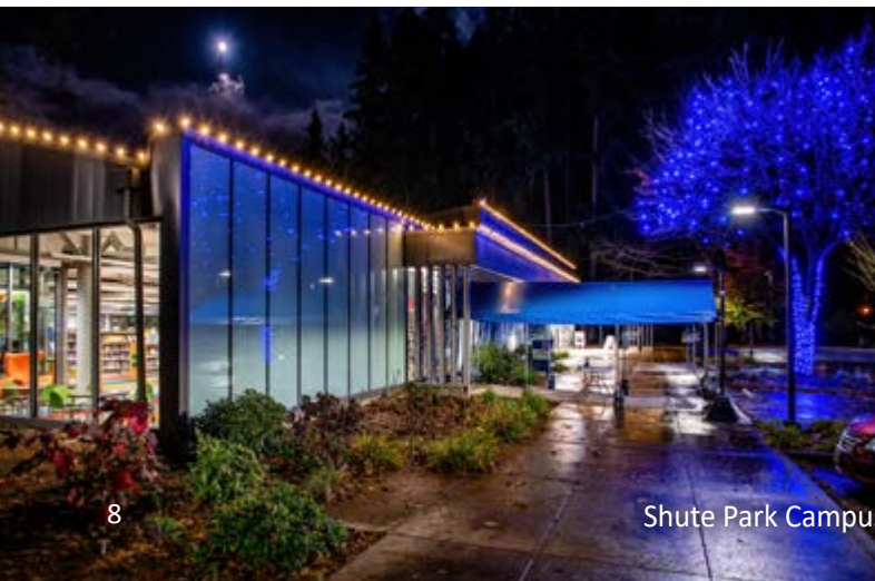
Shute Park Campus