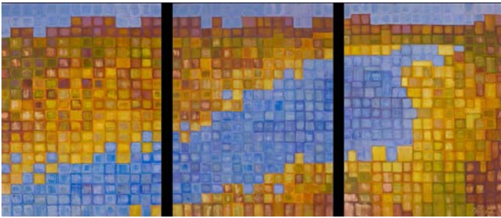
Into the West by Penny Forrest