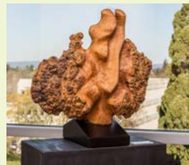
Main Street Burl by Martin Conley

The Sequoia Gallery formed from a grass-roots group of local artists in 2008 and was transformed into the dynamic gallery and cooperative studio space it is today through generous City support. As a show of respect and a means of contributing to the growth of the City's Public Art Collection, 37 artworks were donated by Sequoia Gallery artists between 2013 and 2015. These donations represent nearly a third of all of the works in the City's collection and serve to highlight and celebrate our local artists.