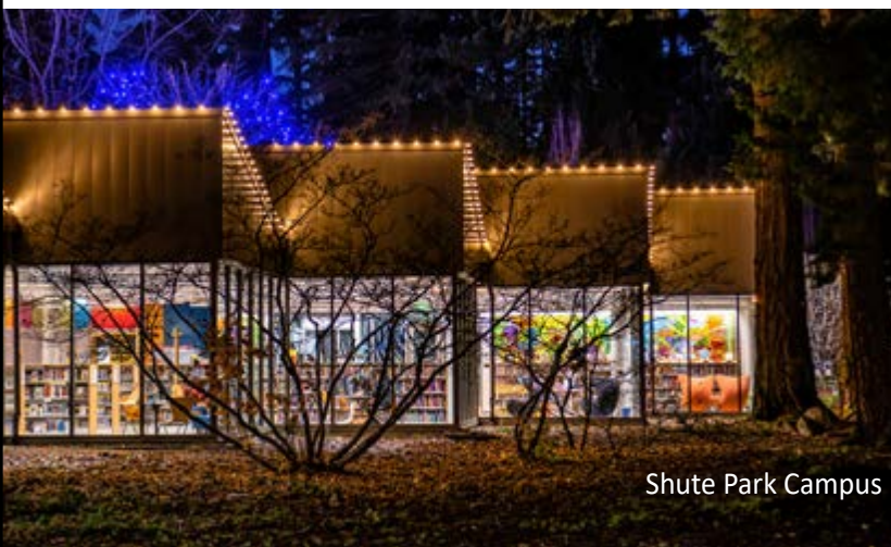
Shute Park Campus