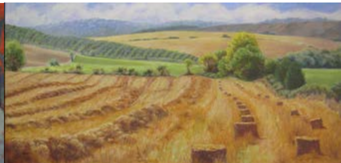
While the Sun Shines by Sylvia Tucker