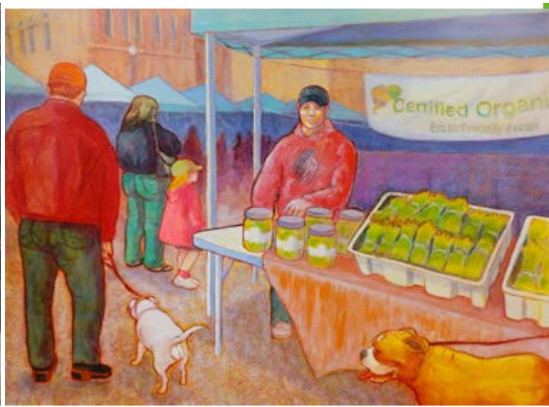
Saturday Market 1